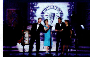
ALL HANDS ON DECK CHRISTMAS SHOW