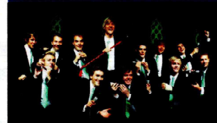
DUBLIN IRISH TENORS & THE CELTIC LADIES CHRISTMAS SHOW

Departure: Big Lots, 20 North Gilbert, Danville, IL @ 8 am, then Paris, IL @ 9 am