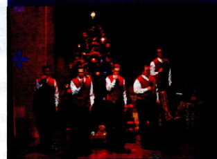
THE HUGHES CHRISTMAS SHOW