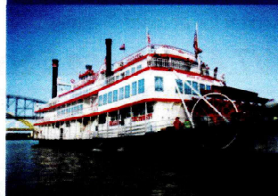
Enjoy a BB Riverboats Sightseeing Cruise

Departure: Big Lots, 20 North Gilbert, Danville, IL @ 8 am, then Paris, IL @ 9 am