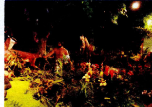
Visit to the Amazing Creation Museum!