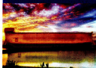
Enjoy a Visit to the Famous Ark Encounter